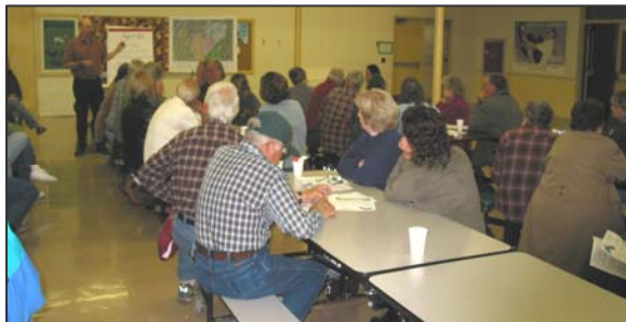
Coffee Klatch October 17 th , 2006

received the most first priority concerns. This particular Coffee Klatch, however, had only a very small number of attendees and the survey may not adequately represent the community. The Daniel's Creek landowners were most broadly concerned about 'habitat and environmental quality', but their top priority concerns were 'development encroaching' and 'sediment and erosion'.