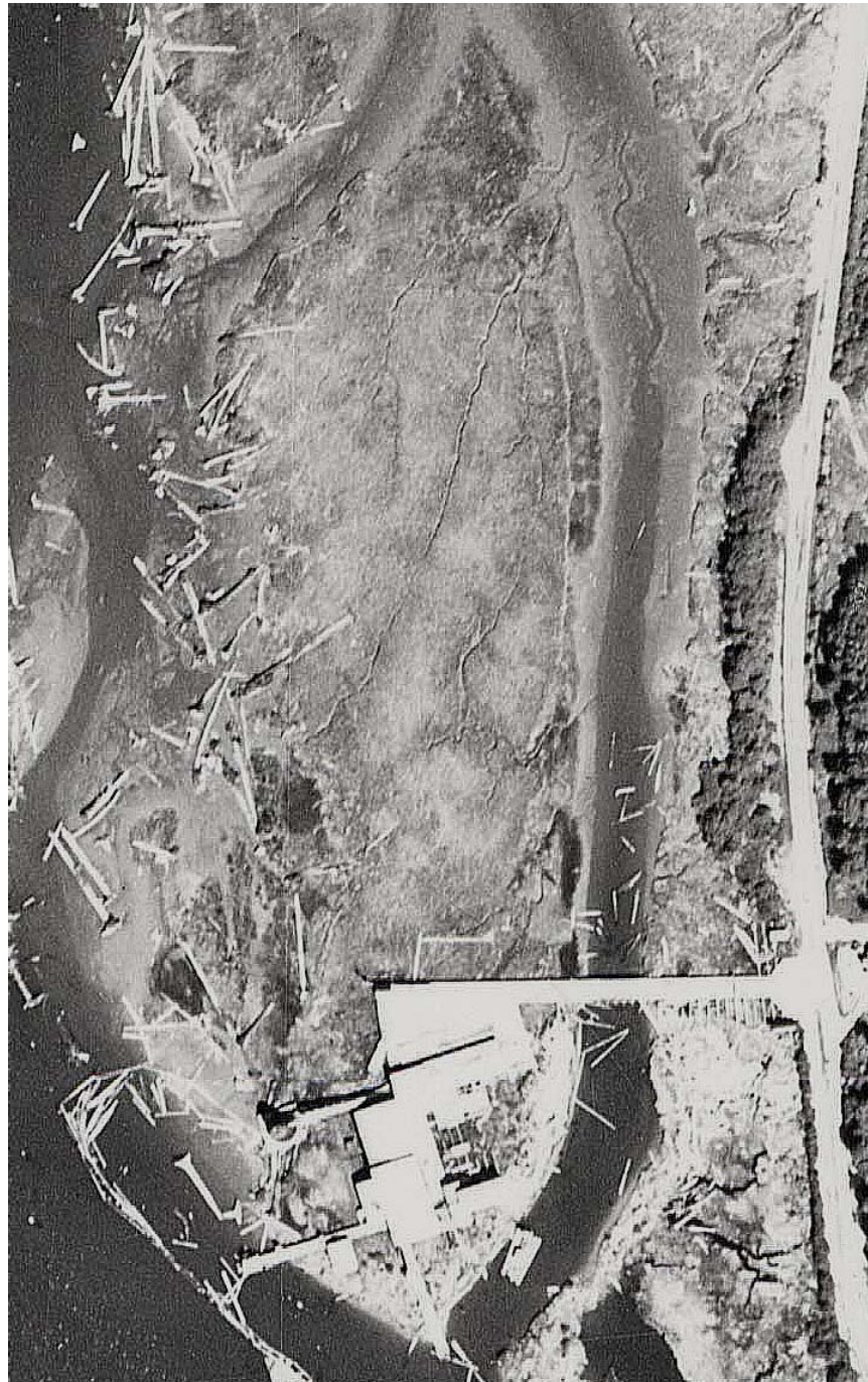
Figure 2. Siletz island marsh in 1939

Wetland 2940I (10 acres, public land) is an island marsh with about 90% high marsh and 10% low marsh. The 1939 aerial photograph (Figure 1) shows several buildings on the south end of this island, with a bridge spanning the short distance to the mainland and a large portion of the western side covered by logs. Currently there are no obvious signs this had ever been the case. The channel network appears mostly unchanged between the two time periods. Agrostis stolonifera dominates the high marsh and Carex lyngbyei the low marsh. The site is managed by the US Fish and Wildlife Service. Mean quarterly salinity at the closest monthly monitoring site, within a hundred meters to the southwest, was reported as 1, 8, 22, and 22 ppt (March, June, September, December).